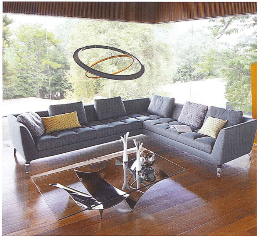
One of the latest ROCHE BOBOIS fabric sectional sofa designs with an innovative seat mattress consisting of independent feather and down filled squares for optimum comfort. www.roche-bobois.com