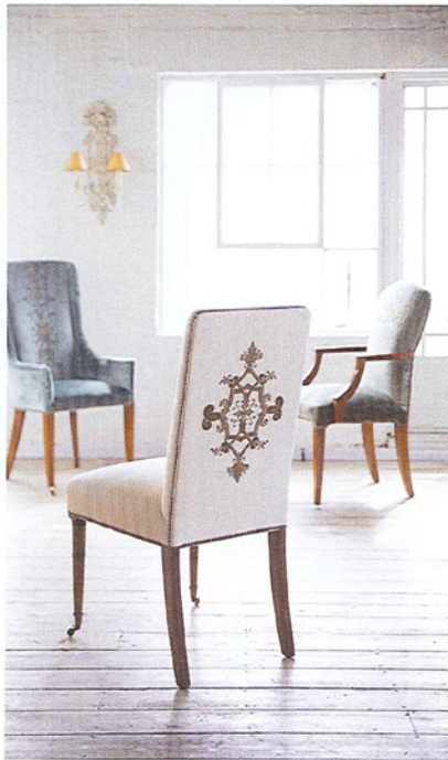
BEAUMONT & FLETCHER have a wonderful selection of handmade dining room chairs, which can be customised to suit your style. The Kingsley, Blake and Pavilion chairs are seen here with Beaumont & Fletcher's stunning embroideries. www.beaumontandfletcher.com