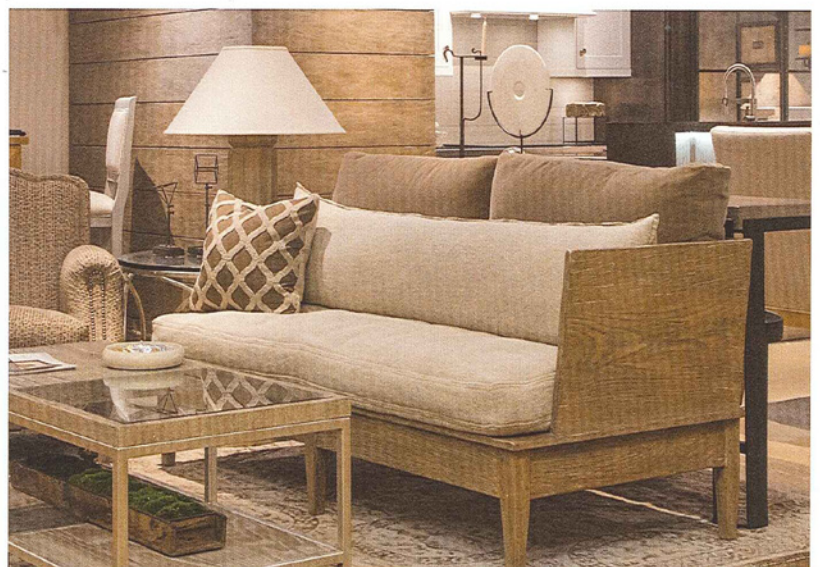
THE STYLISH oak frame of Woodland's Joseph bench is softened with a time-worn Grigio Sahara finish which nicely complements the comfortable and fashionable upholstered cushions (COM fabric). Inspired by tradition with a modern sensibility, additional pieces in this vignette include the Murray cocktail table, Hombre upholstered chair, Nikola side table and the Saguaro table lamp. T: 001 208 523 9006 | www.woodlandfurniture.com