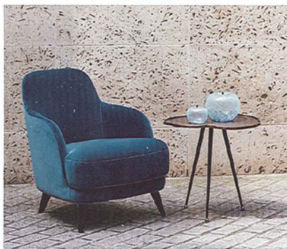
THE LIZ ARMCHAIR by Urban Living Interiors as a deep padded seat cushion which provides exceptional comfort. With its shapely styling and decorative cross stitch seam detailing it's new to the Casamilano collection. Shown here upholstered in fashionable Teal Blue velvet it is available in a range of colours and has solid beech legs. T: +44 (0) 207 637 9427 www.urbanlivinginteriors.co.uk